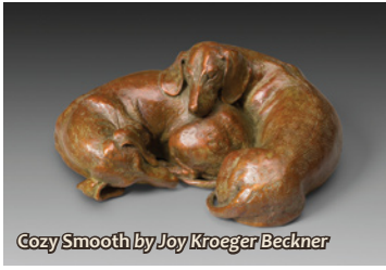
Cozy/Smooth by Joy Kroeger Beckner

After an Art Patron Pre-Sale on Saturday, the online sale will open on Monday, Sept. 14 , at 10 a.m. and will close on September 26 at 2 p.m. The sale site will go live on September 8, when a link and instructions will be provided on the BAC website. If you've participated in the e-BAC auctions or last year's online Classic sale, you should have no trouble navigating the 2020 Art Classic. Call the BAC 254.675.3724 during BAC hours or 254.386.6049 after hours if you have trouble.