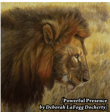
[Powerful Presence by Deborah LaFogg Docherty]

The show will open and close with dinner performances on October 5 and 12. A Sunday matinee is scheduled for Oct. 6, and another regular performance on Oct. 11. Follow the TBT Facebook page for the most current ticket information and show updates, visit us online at bosqueartscenter.org , or give us a call at 254-675-2278. -BD