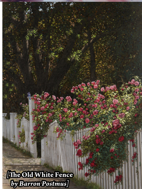
[The Old White Fence by Barron Postmus]

Overnight accommodations for BAC events can be made at various hotels and B&B's in Clifton. Check our website for further information.