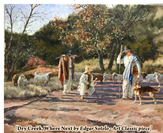
[Dry Creek, Where Next by Edgar Sotelo - Art Classic piece]

The next meeting is September 3 at 6:30 p.m. and all are invited to join us. -LP