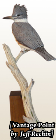
[Vantage Point by Jeff Rechlin]