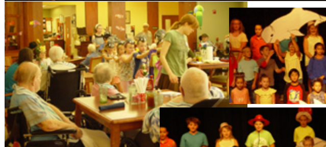
[Music Camp participants entertained LSM residents with new songs & dances they learned in camp July/August]