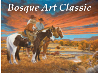
Bosque Art Classic

Newsletter for the Performing & Visual Arts in Central Texas