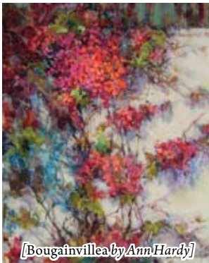
[Bougainvillea by Ann Hardy]

For tickets to the opening exhibit, sale, dinner, and awards ceremony of the Classic, visit the tickets page at www.BosqueArtsCenter.org or call 254.675.3724.