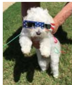
[Thank you, Deb Tolman, for donating a pair of eclipse glasses for our impromptu BAC viewing party on Aug. 21.]

It's an open round table discussion this next meeting. Let's hook up at the Corner Drug Cafe in downtown Clifton, get a table, and talk about gardening for fall or spring, water collecting, glass recycling, farmers' market, diner en blanc , or even keyhole gardens - you name the topic. It'll be fun with tea and crumpets or coffee and dessert, whatever. Plan on 10 a.m. September 20 - a good day for Corner Drug. -DT