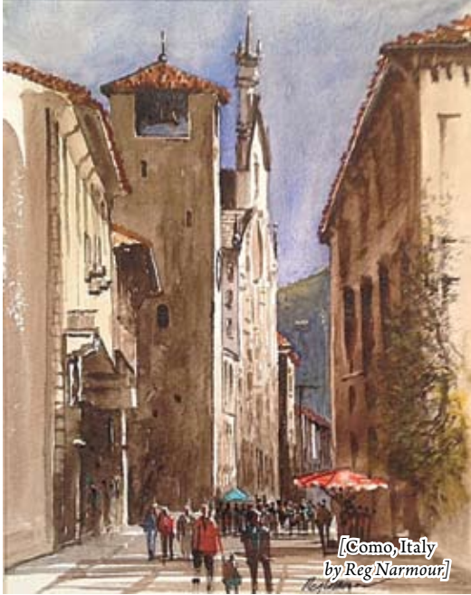
[Como, Italy ]