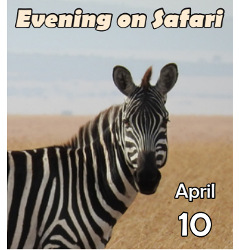
Evening on Safari