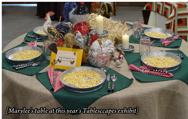
[Marylee's table at this year's Tablescapes exhibit]

decorate for various events, contributed table layouts to Tablescapes exhibits, and pitched in as needed at various other activities.