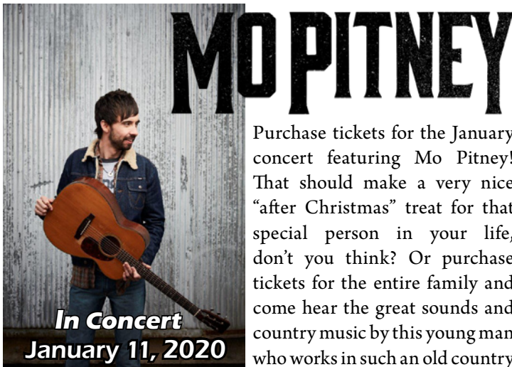
In Concert January 11, 2020