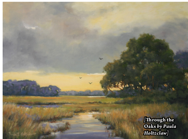
[Through the Oaks by Paula Holtzclaw]

"Art is the only way to run away without leaving home."