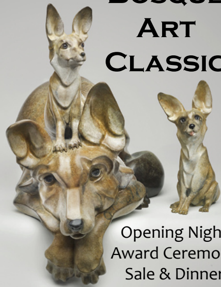
[Curiosity by Pokey Park]

Our next meeting will also have to do with colors. Dyeing your own fabric! Tina Dekle will discuss and demonstrate that process for us. If you're interested, please join us at 6:30 PM for visiting, with our meeting starting at 7:00 PM August 6. -LP