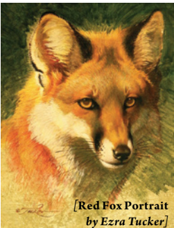
[Red Fox Portrait by Ezra Tucker]