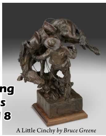
A Little Cinchy by Bruce Greene