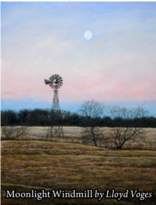
Moonlight Windmill by Lloyd Voges