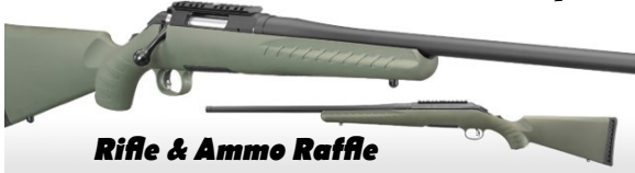
Rifle & Ammo Raffle