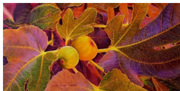
Not Quite But Soon