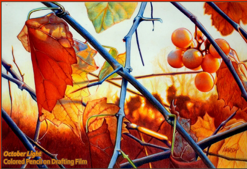
October Light Colored Pencil on Drafting Film