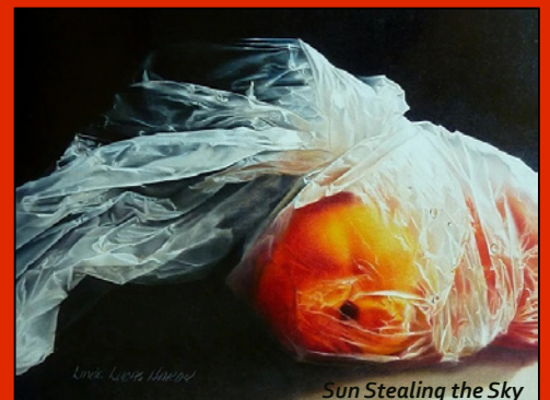
Sun Stealing the Sky