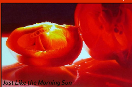
Just Like the Morning Sun