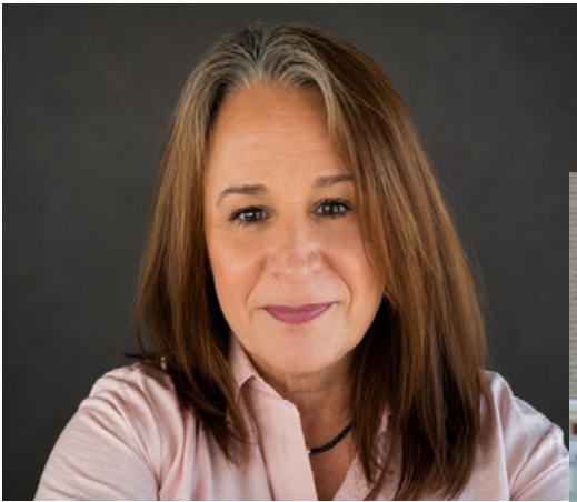
BOSQUE ARTS CENTER NEW BOARD MEMBERS