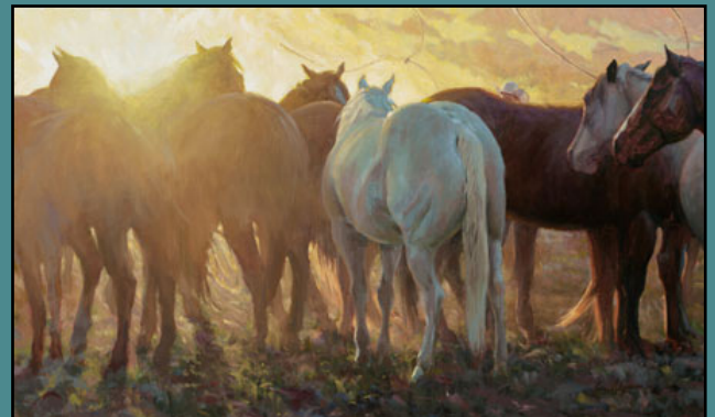
Horse Loops at First Light by Bruce Greene