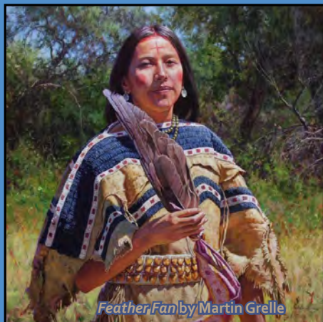
Feather Fan by Martin Grelle

Continental breakfasts and lunches are included in the workshop fee.