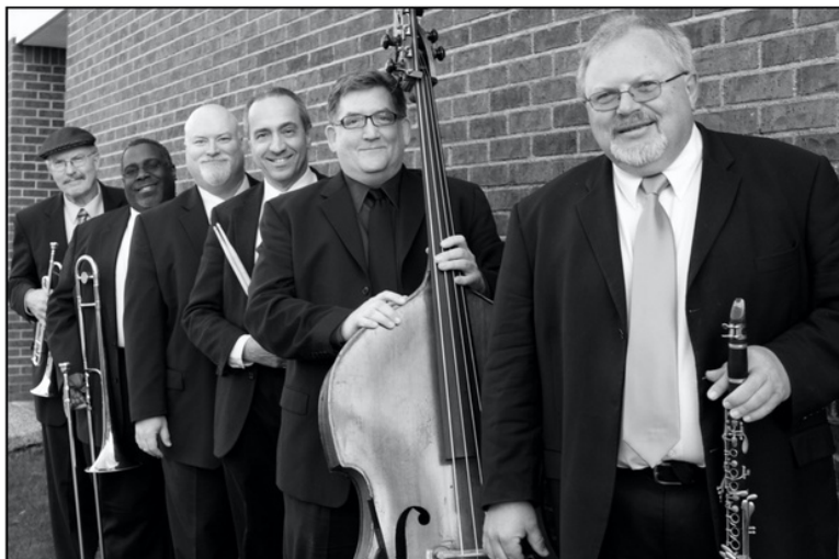
The N'AWLINS Gumbo Kings

Reserve your tickets at bosqueartscenter.org or by calling 254-675-3724.