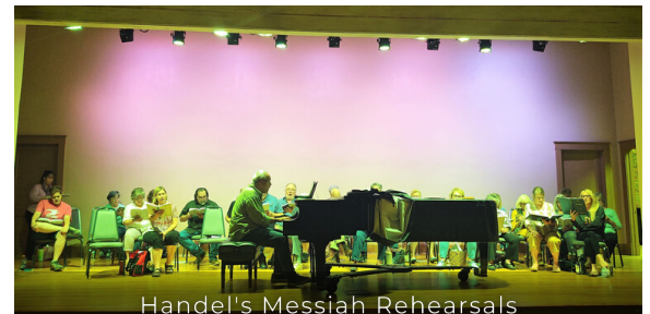
Handel's Messiah Rehearsals