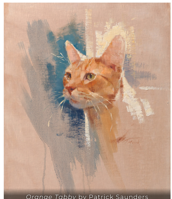
Orange Tabby